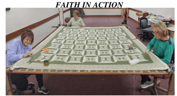
Join the Quilters on March 6, 10-14!